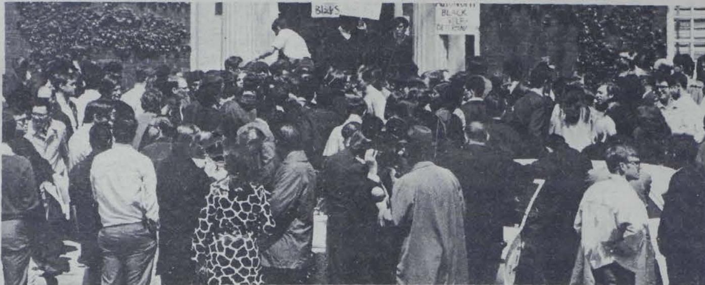
The crowd at Clark street bursar's office at midday; and out back, the only way in was head first, with a little bit of help.