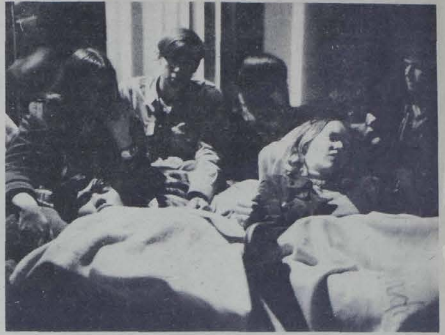
THE FREEZE OF THE NIGHT